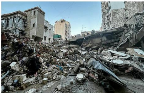
Deadly strike: A building flattened by an overnight Israeli strike in Shiah in Beirut's southern suburbs on Sunday.

At least 24 people were killed in Israeli airstrikes that hit two adjacent buildings east of the southern city of Sidon, the Lebanese Health Ministry said. In Baalbek-Hermel, 21 people were killed and at least 47 injured. Four more died in a raid targeting Joub Jenin in the Bekaa area. The con-