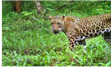
Smile, big cat: A leopard captured by cameras installed in a forest in Odisha.

"Sites with confirmed direct or indirect evidence of leopard were monitored using camera traps to estimate the minimum number of unique adult leopards based on their