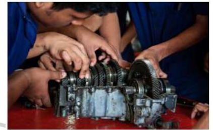
The process is expected to result in about one lakh youth joining on-the-job training exercises by December 2.