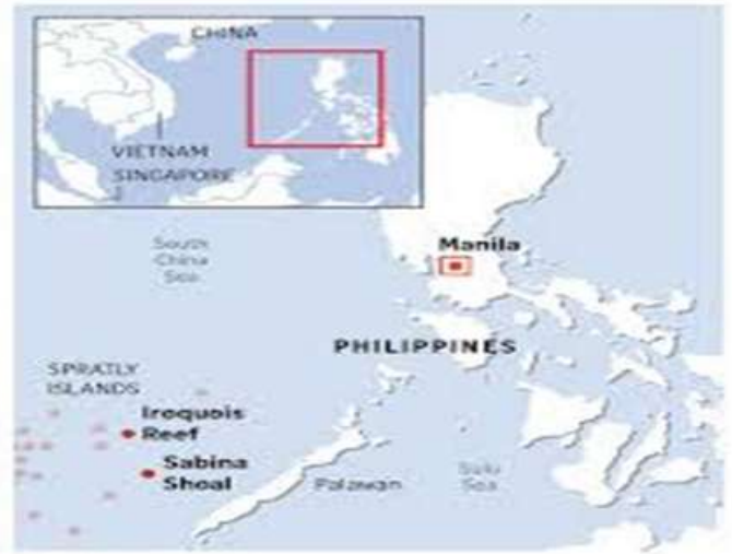
STRAITS TIMES GRAPHICS

This is the fifth such incident in a month . Sabina Shoal is located 140 km from Philippines island Palawan , and 1200 km from Hainan island of China .