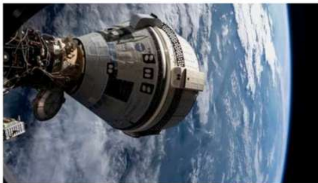
Stuck in space: Boeing's Starliner capsule docked at the International Space Station.

The two astronauts will return back to earth on the SpaceX Orion capsule in February.