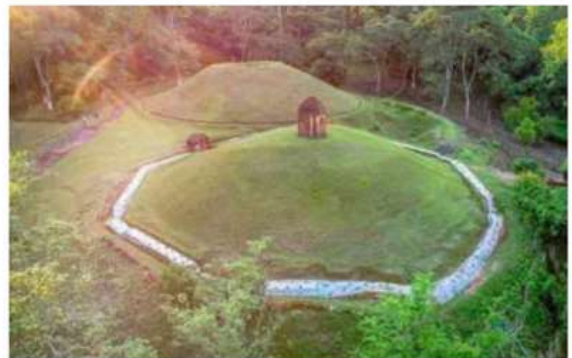
An aerial view of the royal burial mounds built by the Ahom dynasty in Charaideo in eastern Assam.

This makes Charaideo district a tourist destination .