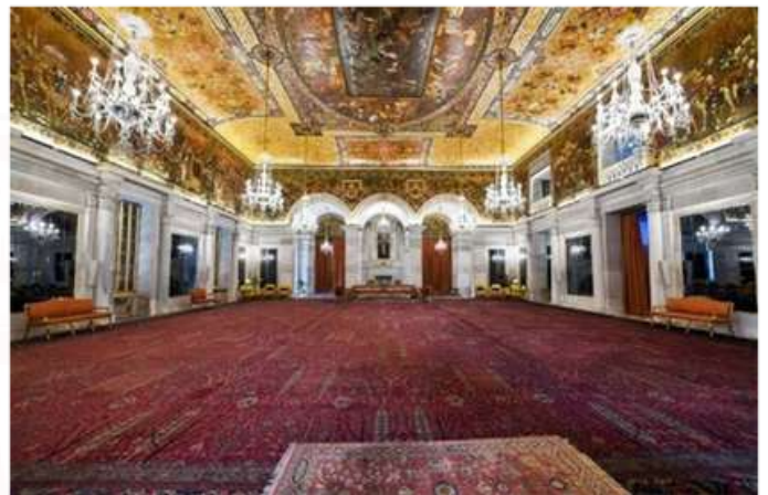
Darbar hall and Ashok hall