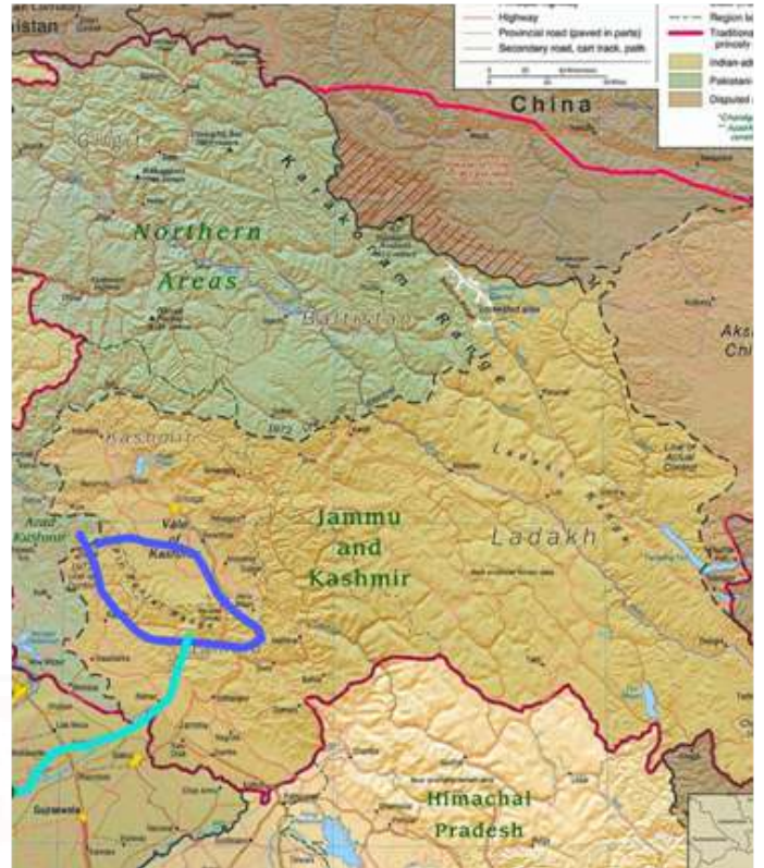
Pir Panjal Range - Blue , Chenab river - green Pir Panjal Range divided Jammu from Kashmir

Use of these technologies makes their movement very hard to detect by Indian security intelligence. People residing in these regions have reported a high number of militant movements .