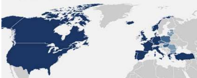
FIGURE 1 The expanded NATO alliance

Bangladeshi police have charged 26 people for destroying a swathes of mangroves forest that protects the low lying nation from storm surge waters exacerbated by cllmate change. They have destroyed part ofa unique ecosystem , which has been declared as an Ecological Sensitive Zone .