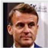
Ensemble! CENTRIST Emmanuel Macron