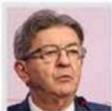
New Popular Front (NFP) LEFT Jean-Luc Melenchon