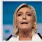
National Rally (RN) and allies FAR RIGHT Marine Le Pen

France's far-right National Rally (RN) party has won the first round of snap parliamentary elections. Three parties will go to the second round on July 7.