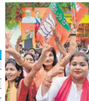
Results as of 1.00 a.m.