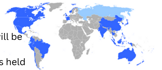
RIMPAC particoaltns . light blue those which do notnparticpate now