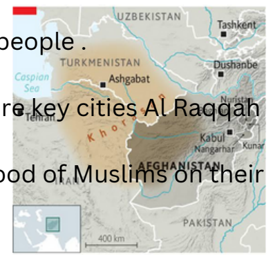
ISIS K Operating Zone