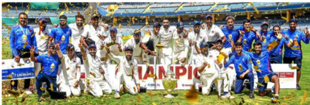
Journey of rediscovery: Mumbai ended its second-longest title drought in the Ranji Trophy with a thumping win over Vidarbha on Thursday.