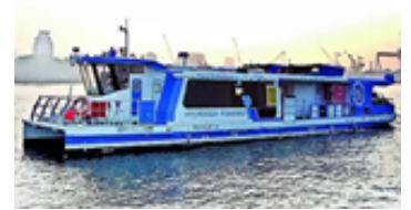
First hydrogen powered boat