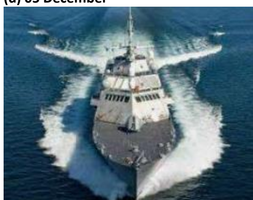
Indian Navy Day is celebrated every year on 4 December across the country to honor the role and