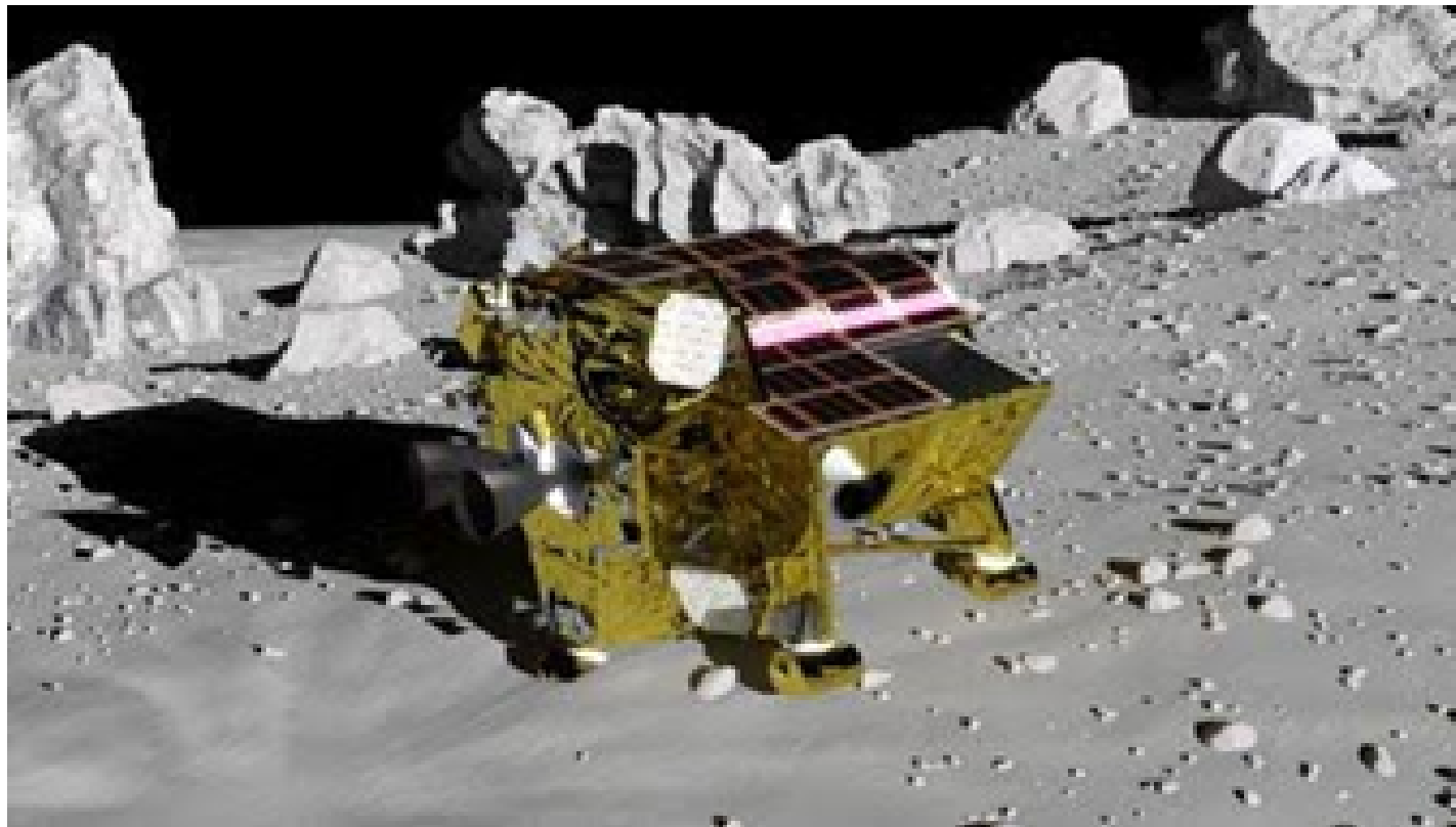
SLIM smart lander

LUPEX ( Lunar Polar Exploration Mission ) is planned for 2026 .