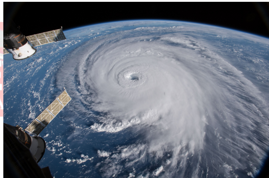
Tropical cyclone as seen from satellite

Cyclone Michaung made its landfall at Bapatala at 12:30 on December 5. It moved towards North with a speed of 11 km / hr . By 6 PM on 6 December cyclone had completely subsided