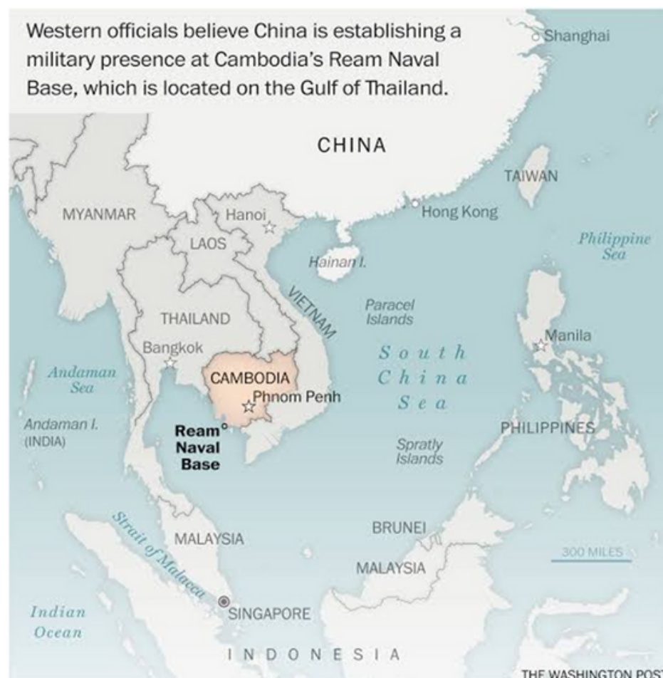
Ream Naval Base to be used by China

Chinese Naval vessel has become the first to dock at new pier , at a Combodian Naval base .US and security analyst has said that the base is going to serve as a strategic outpost for Beijing in future