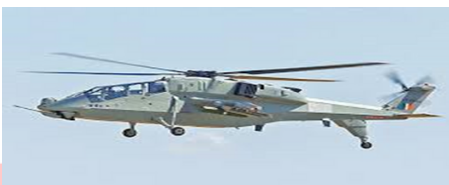
LCA Tejas and Prachand