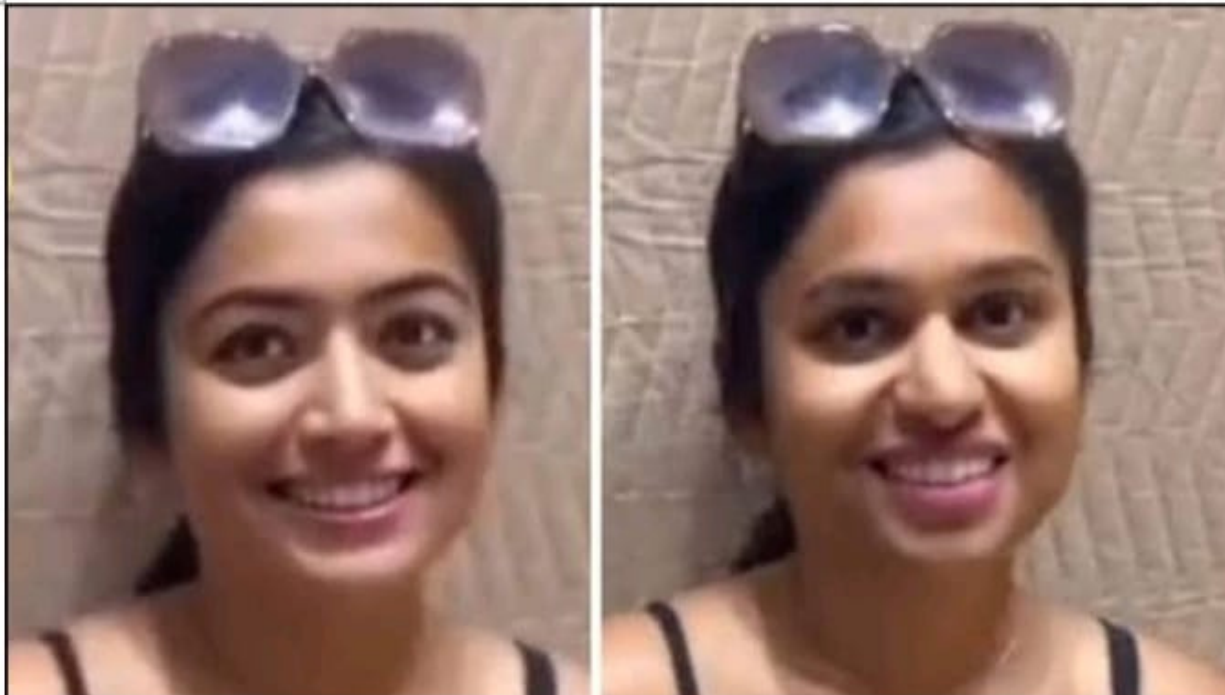
Deepfake video of Rashmika mandana

Recently deepfake video of actress Rashmita Madana had gone viral .