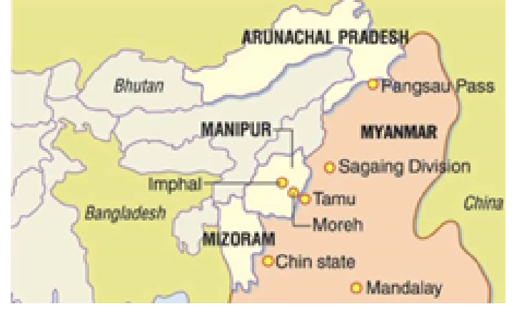
Myanmar border with India, and Mizoram