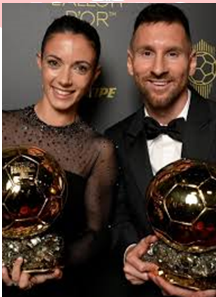
Messi and Bonmati with Ballon d or

Argentinian football star Lionel Messi won Ballon d or award eighth time . In women category Spanish midfielder Aitana Bonmati won the award . Ballon d or award is given to best footballer of the year