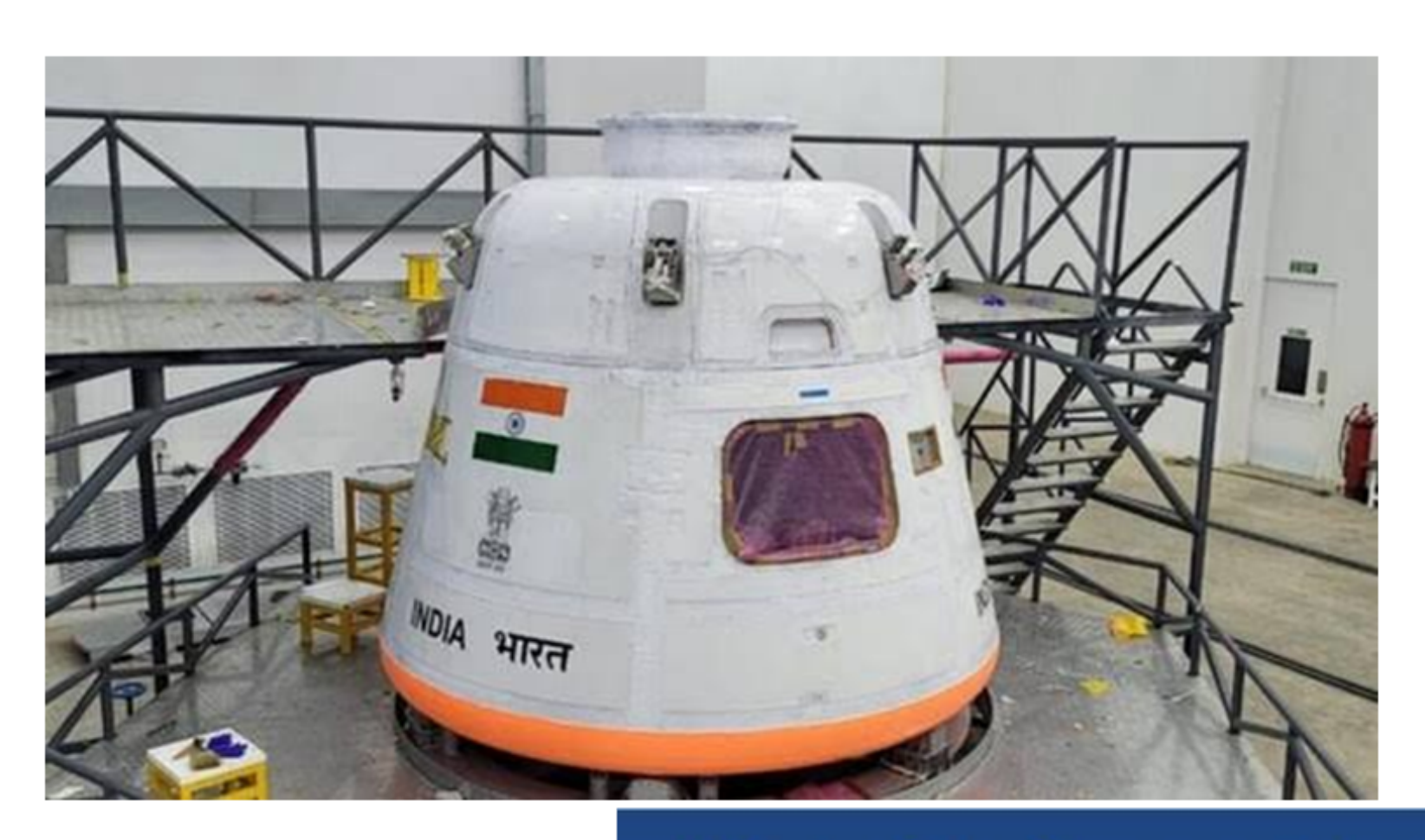
Maiden test flight of Gaganyaan mission