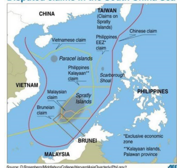
Disputed claims in the South China Sea

China's Coast Guard claimed to have chased a Philippines ship from a disputed Scarborough shoal. Beijing said that Philippines ship had sailed into water next to the Scarborough shoal and ignored "multiple calls" to turn back.