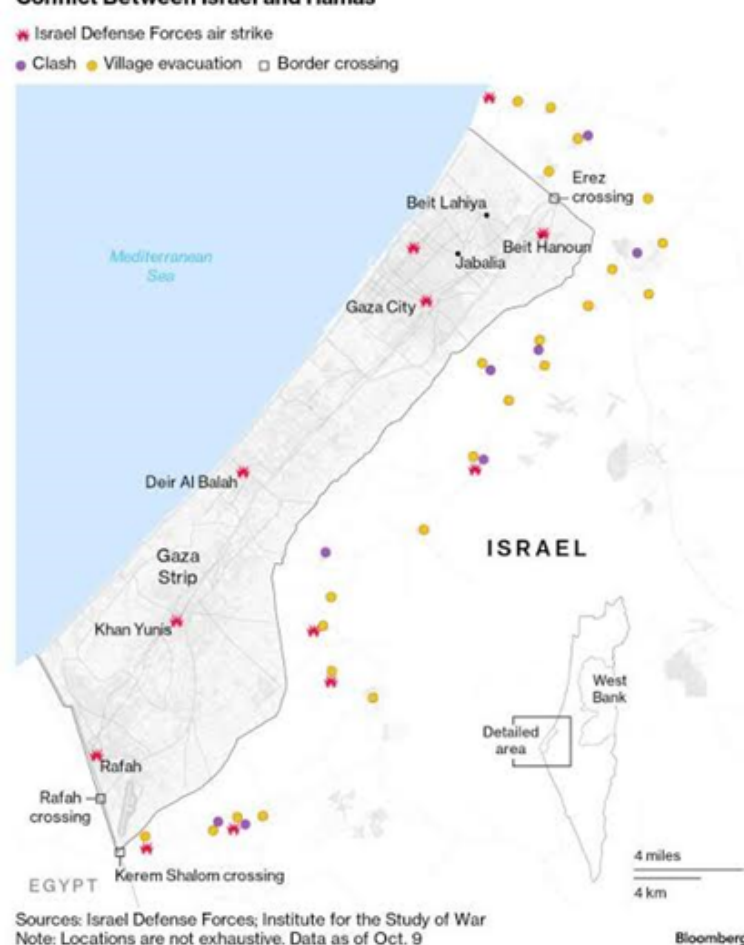
Conflict Between Israel and Hamas