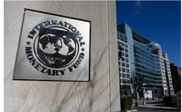
The International Monetary Fund (IMF) raised India's GDP estimate to 6.3 percent, while reducing the global