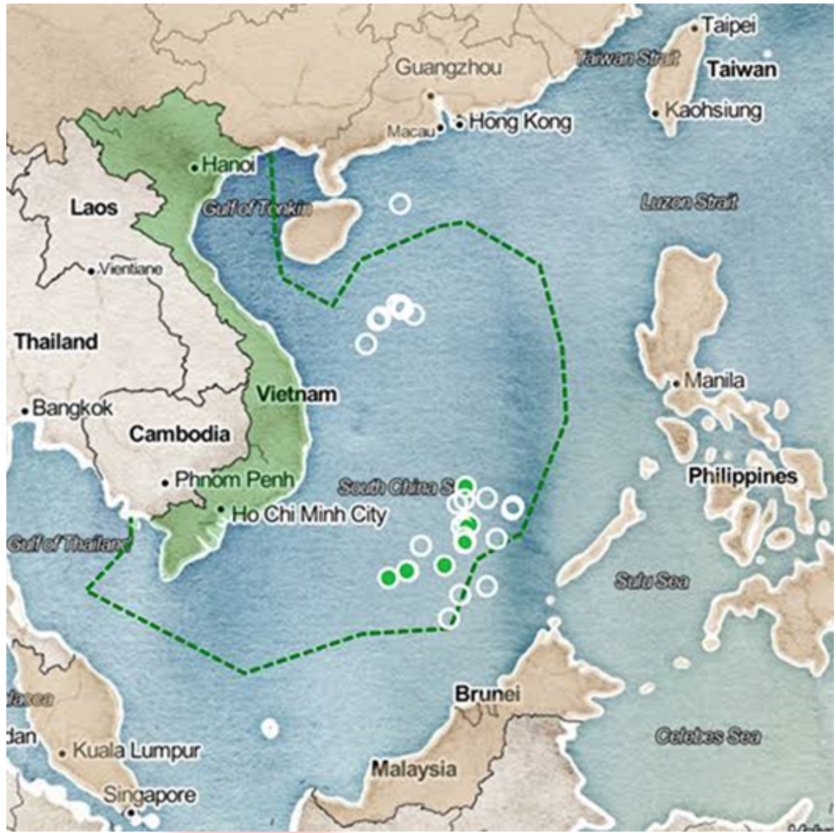
Vietnam in South China sea

Kim Jong Un will visit Russia, setting the stage for a meeting with Putin