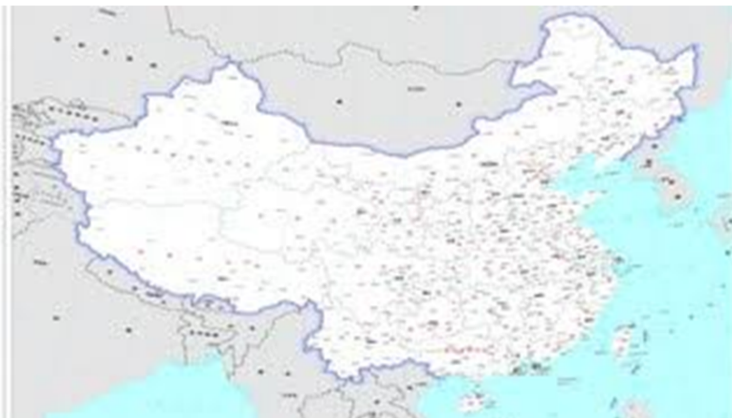
" Standard map " of China which Shows Arunachal and Aksai Chin as part of China