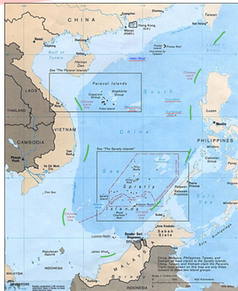
None dash line - China claim in South China sea