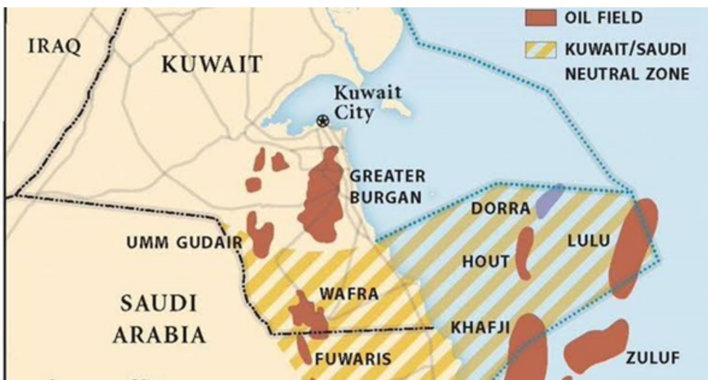
Oil field in Persian Gulf. Derra oilfield