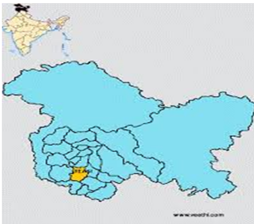
In 2022 a large reserve of lithium was Discovered in RAESI district of J&K

Other minerals that govt has opened for mining is beryl , niobium , titanium and zirconium . These were earlier allowed to be mined by state owned companies only . The involvement of private firms will be " force multiplier " ,govt statement said .