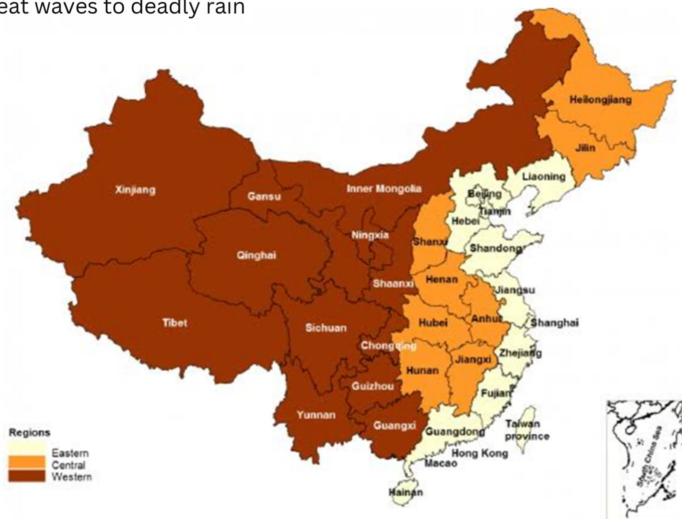
Eastern part of China has been hit by rain and typhoon

China has been hit by hard by extreme weather in recent months , from record-breaking heat waves to deadly rain