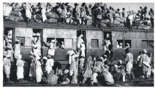
Hindus and Sikhs' families migrating from Bannu to India - 1947

India observes 'Partition Horrors Remembrance Day' to remember the horrors of Partition, commemorating the victims of the violence that took place during the partition of the country. The day was announced by Prime Narendra Minister Modi in 2021, commemorating the displacement of lakhs of people and the loss of their near and dear ones during Partition. This day was celebrated with many programs in India. A candle light vigil was organized at the India Gate War Memorial in New Delhi. In Punjab, a special exhibition was organized to showcase the stories of Partition evacuees and in Kolkata, a blood donation camp was organized to mark the day. On Partition Horrors Remembrance Day, victims of the 1947 violence share their stories of pain and loss. They reported that they were forced to leave their homes,