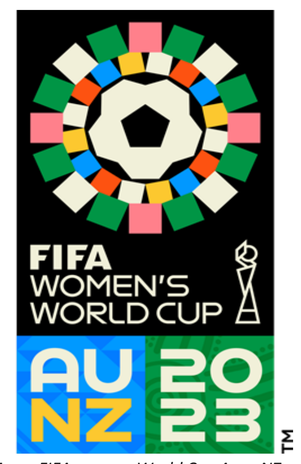
Logo FIFA wome s World Cup Aus - NZ