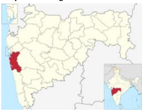
Raigad district map in Maharashtra.