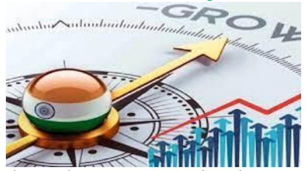
The United Nations Economic and Social Commission for Asia Pacific (UNESCAP) has recently released the

"Global Survey on Digital and Sustainable Trade Facilitation 2023". India has performed better in the survey. India is now the best performing country among all the countries in the South Asia region. The overall score of India has been higher than many developed countries like Canada, France, UK, Germany. The year 2023 survey covers over 140 economies and evaluates 60 trade facilitation measures. In the year 2023, India has achieved a score of 93.55 percent which is higher than the score of 90.32 percent in 2021. The 2023 survey recognized India's exceptional progress in various sub-indicators, in which the country scored in four key areas: transparency, formalities, institutional arrangements and cooperation, And has achieved an excellent score of 100% in Paperless Business. These notable points are aimed at streamlining trade processes, increasing transparency and facilitating collaboration among stakeholders through initiatives such as prompt customs, single window interface for trade facilitation (SWIFT), pre-arrival data processing, eaggregate, coordinated border management. India's efforts in promoting India has achieved a score of 77.8 per cent in 2023 as compared to 66.7 per cent in 2021 in the score for the "women in trade facilitation" component.