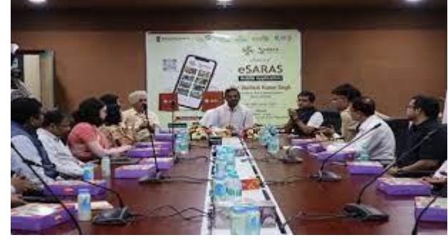
The Government of India has introduced a mobile application to make the products made